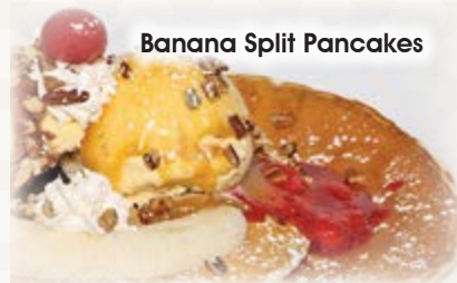
Banana Split Pancakes