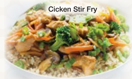
Chicken Stir Fry

Sub a vegetable patty for a beef patty. We have 7 kinds of potatoes. Add jalapeños to anything. Dipping sauces include Buffalo, horseradish, garlic, aioli, BBQ & Ranch. Gluten Free Friendly bread available for any toast or sandwich. Gluten Free Friendly Cauliflower Tortilla Wraps. Locally supplied Milos Omega 3 organic eggs, riced vegetables or fresh fried tortilla chips & salsa.