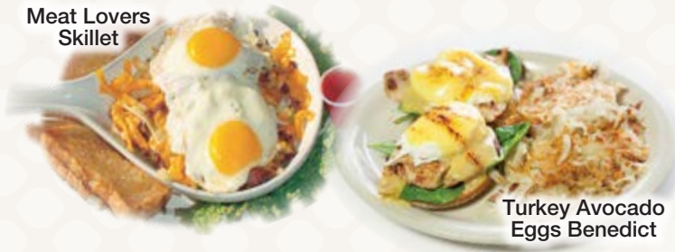
Turkey Avocado Eggs Benedict

CORNERED BEEF HASH SKILLET* House Made corned beef hash served with choice of farm fresh eggs over hash browns 8.79