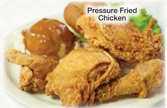
Pressure Fried Chicken