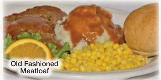
Old Fashioned Meatloaf