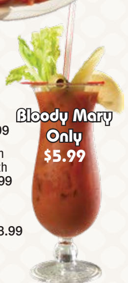
Bloody Mary Only $5.99

MEAT LOVER'S BISCUITS & GRAVY* Two buttermilk biscuits smothered in thick creamy sausage gravy, ham, sausage, bacon, and two eggs (any style) 9.25