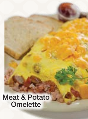
Meat & Potato Omelette

GYRO OMELETTE* Gyro meat, tomato, sweet onions & Feta cheese folded into farm fresh eggs 7.79