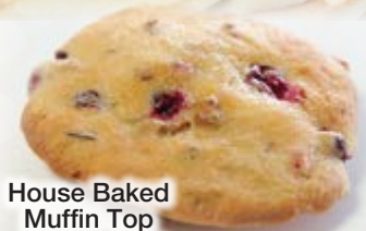
House Baked Muffin Top