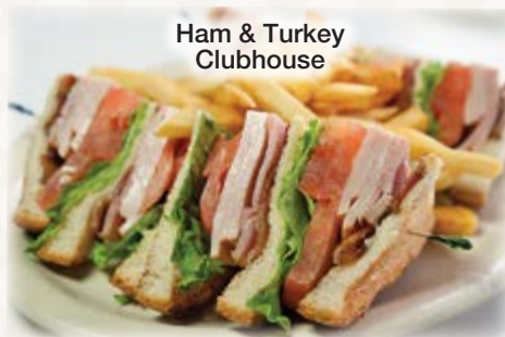
Ham & Turkey Clubhouse