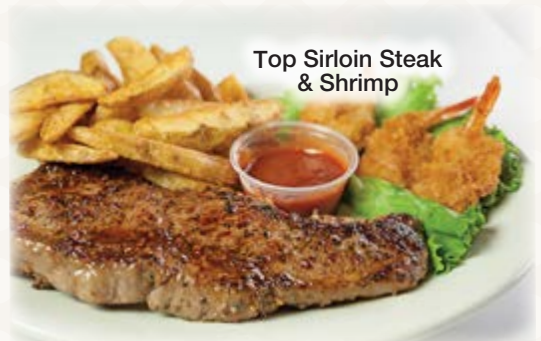
Top Sirloin Steak & Shrimp

CHOPPED SIRLOIN STEAK* 1/2 lb. juicy Sirloin steak charbroiled to taste & topped with mushrooms & onions *Something special from Wisconsin Beef 10.49