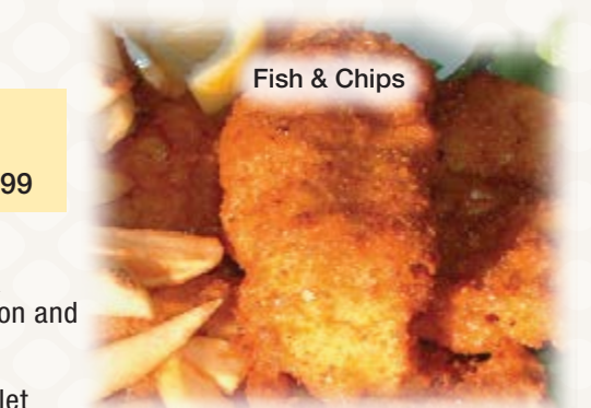
Fish & Chips