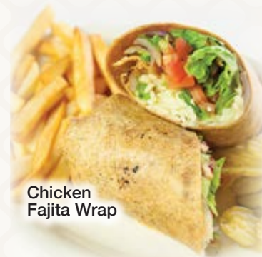
Chicken Fajita Wrap

Juicy steak or chicken sliced thin, peppers, onions, tomato, wrapped with Monterey Jack cheese & lettuce on a chipotle tortilla with Southwestern dressing 8.49