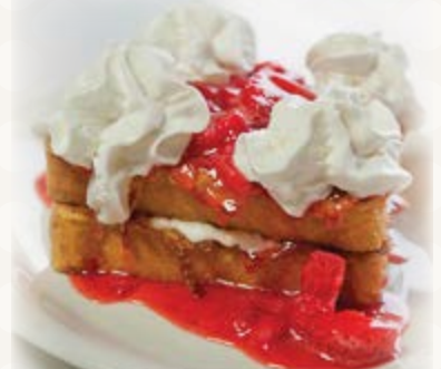
Strawberry Stuffed French Toast