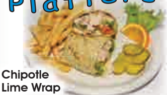
Chipotle Lime Wrap

CHICKEN OR STEAK FAJITA WRAP Juicy steak or chicken sliced thin, peppers, onions, tomato, wrapped with Monterey Jack cheese & lettuce on a chipotle tortilla with Southwestern dressing. . . . . 6.99