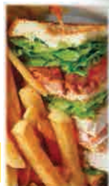
Ham & Turkey Clubhouse

CHICKEN SALAD CROISSANT SANDWICH Made with chicken breast & dried cranberries on a croissant . . . . . 6.99