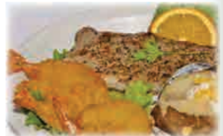
New York Strip & Shrimp

Choice of Two Sides. Add onions & mushrooms for $2.00