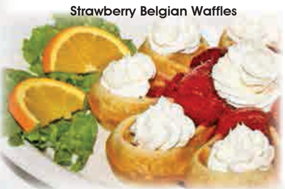
Strawberry Belgian Waffles